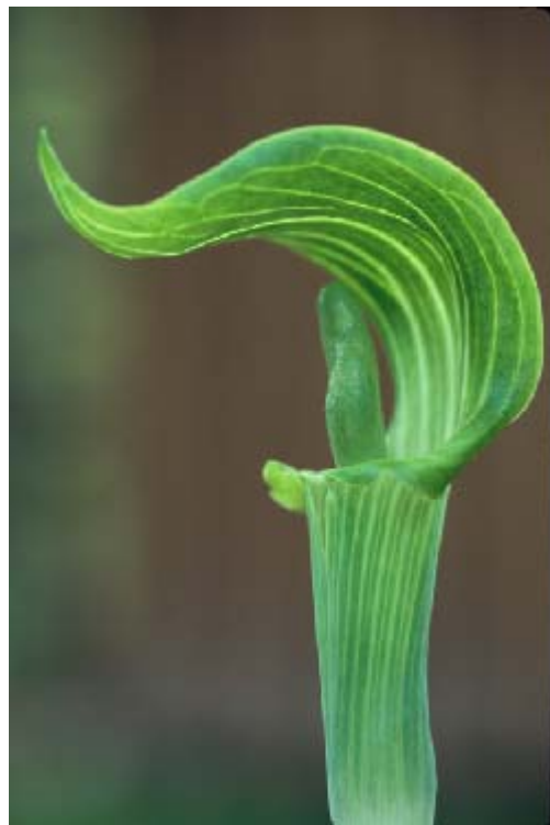
Jack in the Pulpit.....