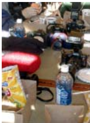
Photographers lunch table