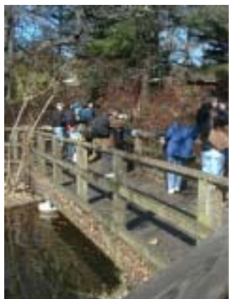
One bird many photographers